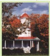
- Historic Russellville Home at the corner of Jackson and Cotaco