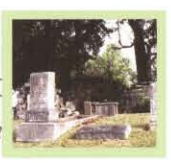
- Historic Cemetery

Small Town Design Initiative - Fall 2001 - Spring 2002 - Auburn University Center for Architecture & Urban Studies - Birmingham, AL 205-323-3592