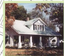
- Historic Home