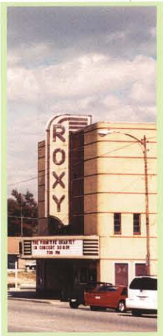
- Historic Roxy Theater