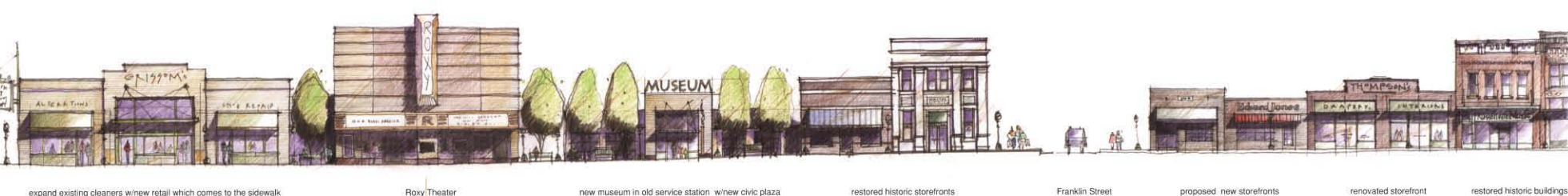
expand existing cleaners w/new retail which comes to the sidewalk | Roxy Theater | new museum in old service station w/new civic plaza | restored historic storefronts | Franklin Street | proposed new storefronts | renovated storefront | restored historic buildings