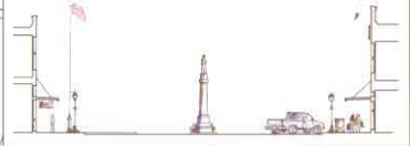
- Typical Street Section along Jackson looking South