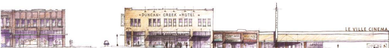
restored historic buildings | Lawrence Street | proposed hotel over storefront retail | restored storefronts | proposed new cinemas in renovated furniture store