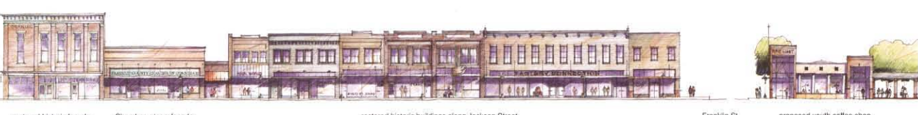
restored historic facade | Chamber window facade | restored historic buildings along Jackson Street | Franklin St. | proposed youth coffee shop

Long an industrial center, Alabama's first iron furnace was established in 1818 on Cedar Creek, just outside the original settlement. Other industry included brick-manufacturing, limestone mining and stone mining. Farming along with industry attracted the railroad in 1886.